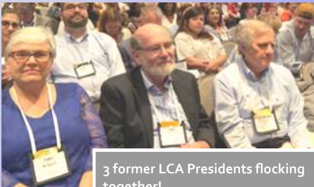
3 former LCA Presidents flocking together!