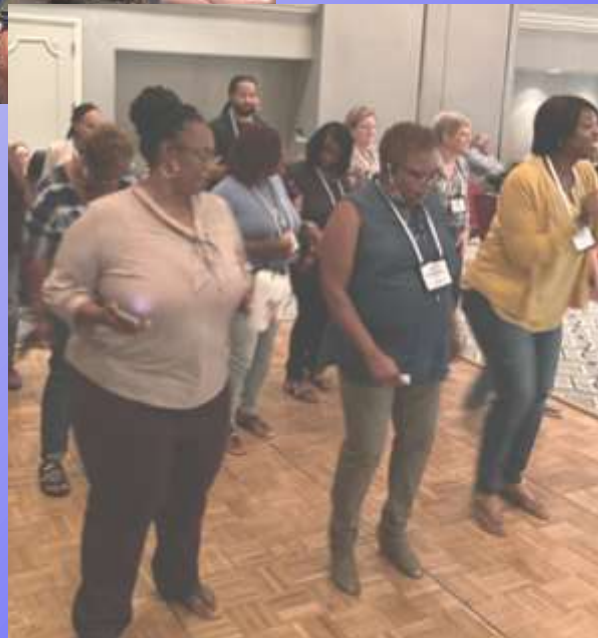
Old tradition reborn: LCA line dancing at the President's Reception!