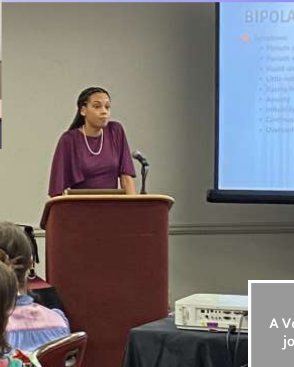
Well attended content sessions