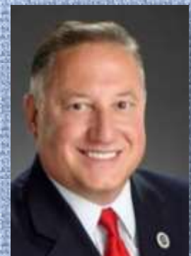
Rep. Joe Stagni