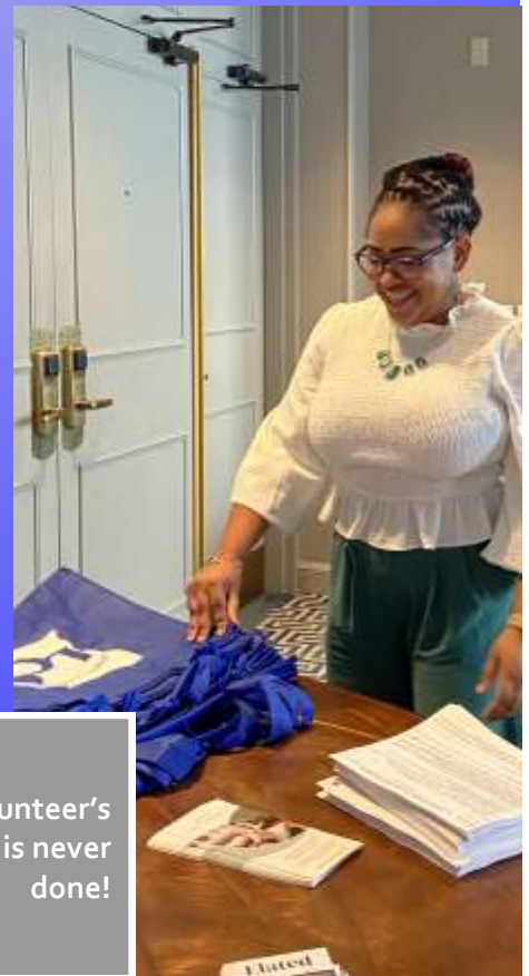
A Volunteer's job is never done!