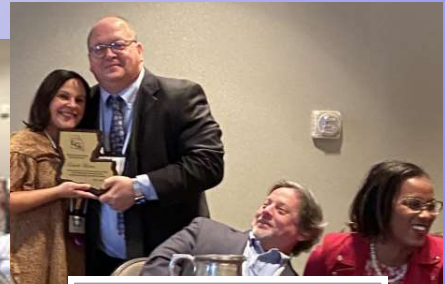
Worth a 1,000 words!