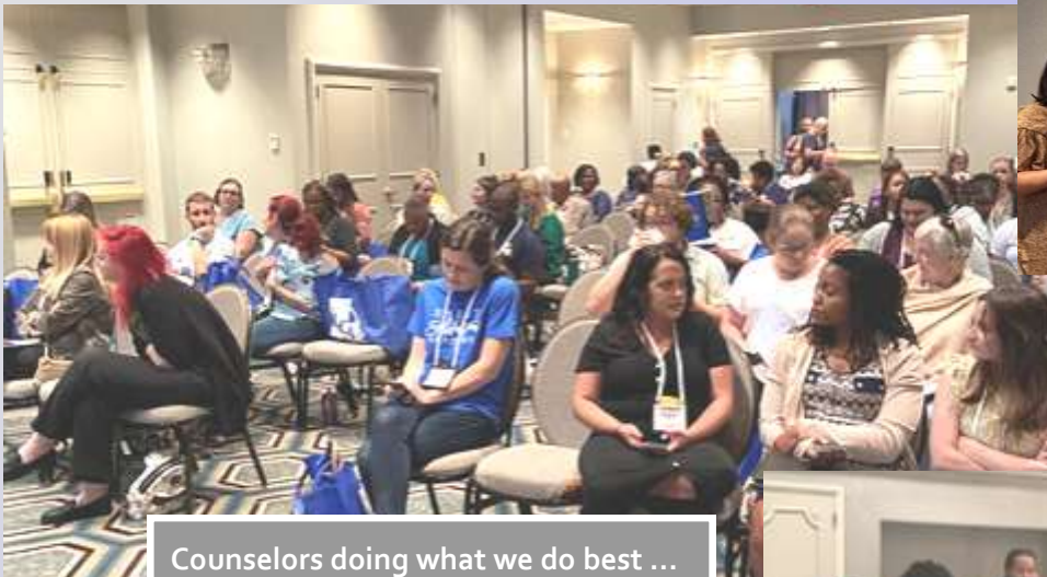
Counselors doing what we do best ... networking!