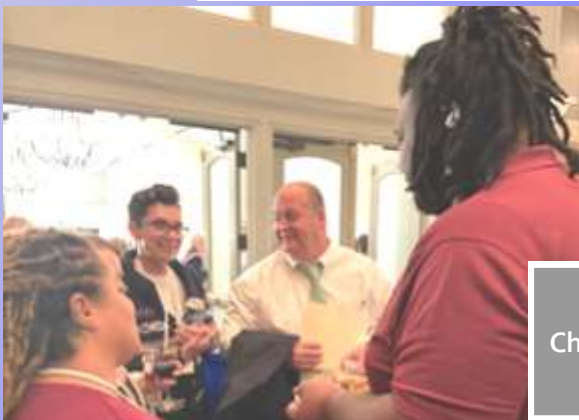
Chatting with the Prez!

Candid pictures at the Fall Conference at the Crown Plaza Hotel.